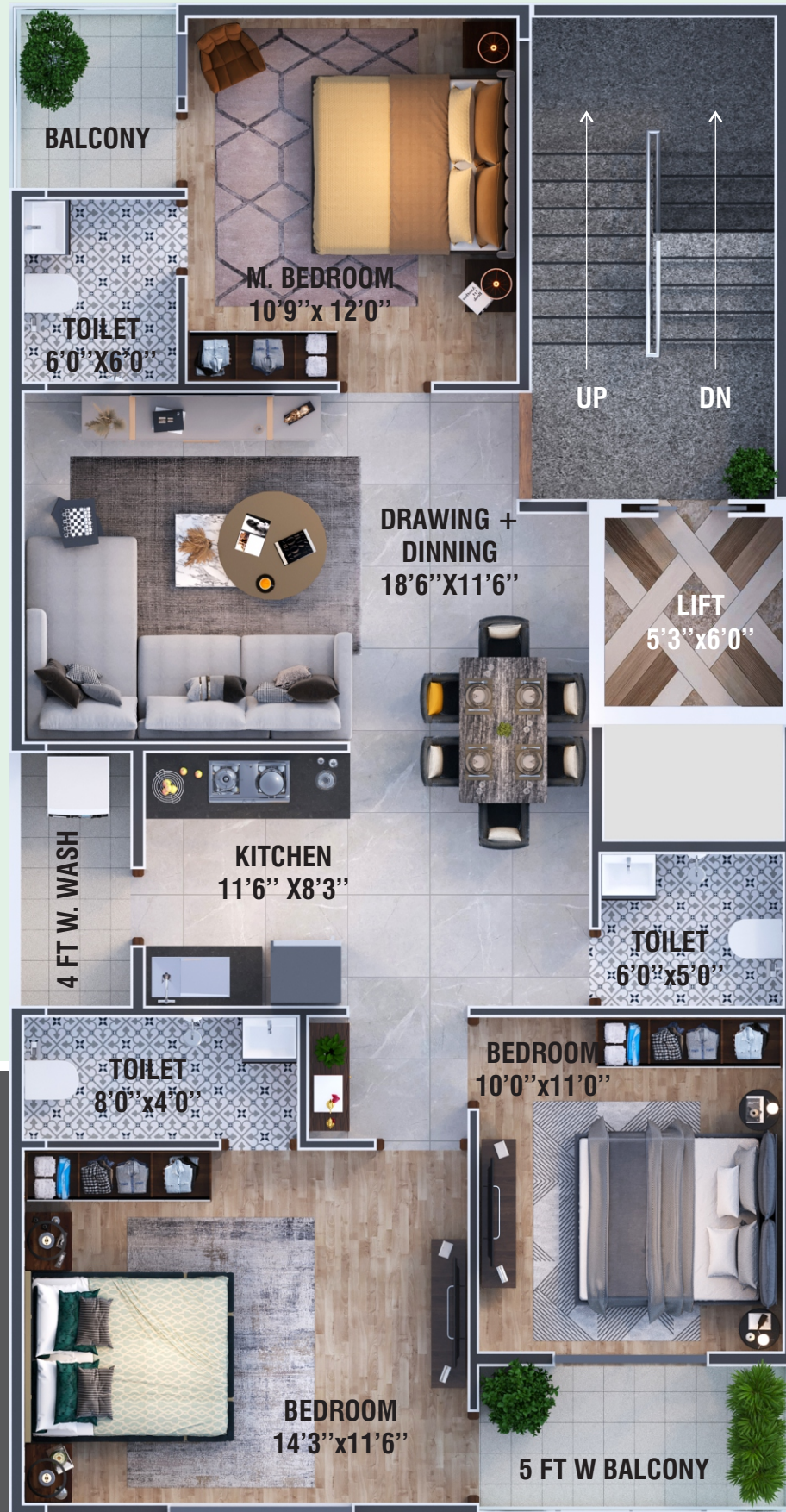
1 st to 6 th typical floor plan